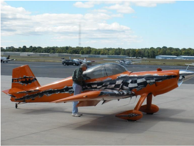
Small aerobatic plane on the ramp the day of the B-17 traveling history tour event.

FAUQUIER AERO RECREATION MODELERS Jeff Killen 10297 Woodmont Ct. Manassas, VA 20110-6164