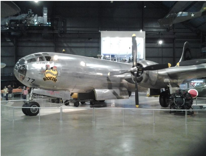
Beautiful, but deadly !

Jeff Killen 10297 Woodmont Ct. Manassas, VA 20110-6164