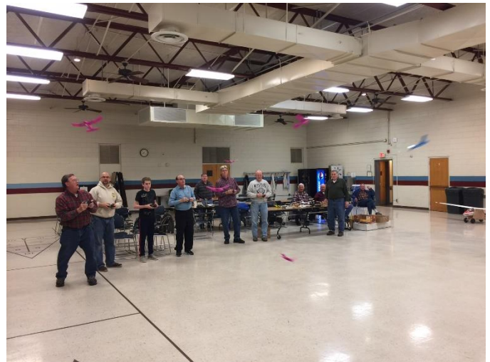
The gang is flying small R/C @ Jan. club meeting.